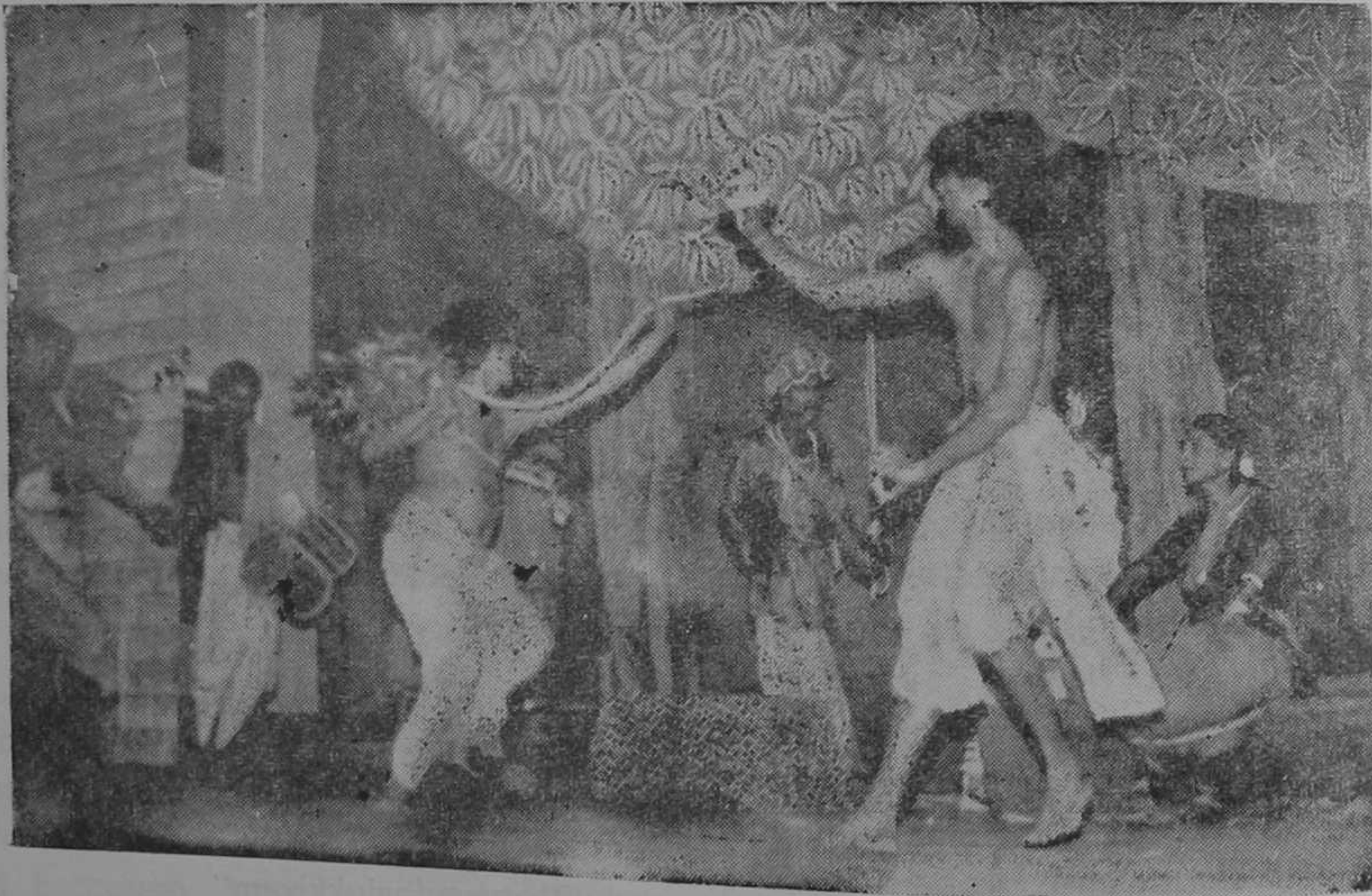
A Scene from the Tamil play "BHAGAVATHAJUCKIYAM"

contemporary relevance of themes of some of the original texts motivated these young theatre workers to present their productions. Their attempts and efforts are laudable and praiseworthy. However, an optimistic view about its immediate success among the laity and elite could not be felt. It may perhaps be due to the fact that a majority of theatre goers of our country are already obsessed with the imagical and realistic charms of the present day conventional plays caused by the influence of Western theatre. Time alone could predict the success or otherwise of the impact of this new theatrical movement.